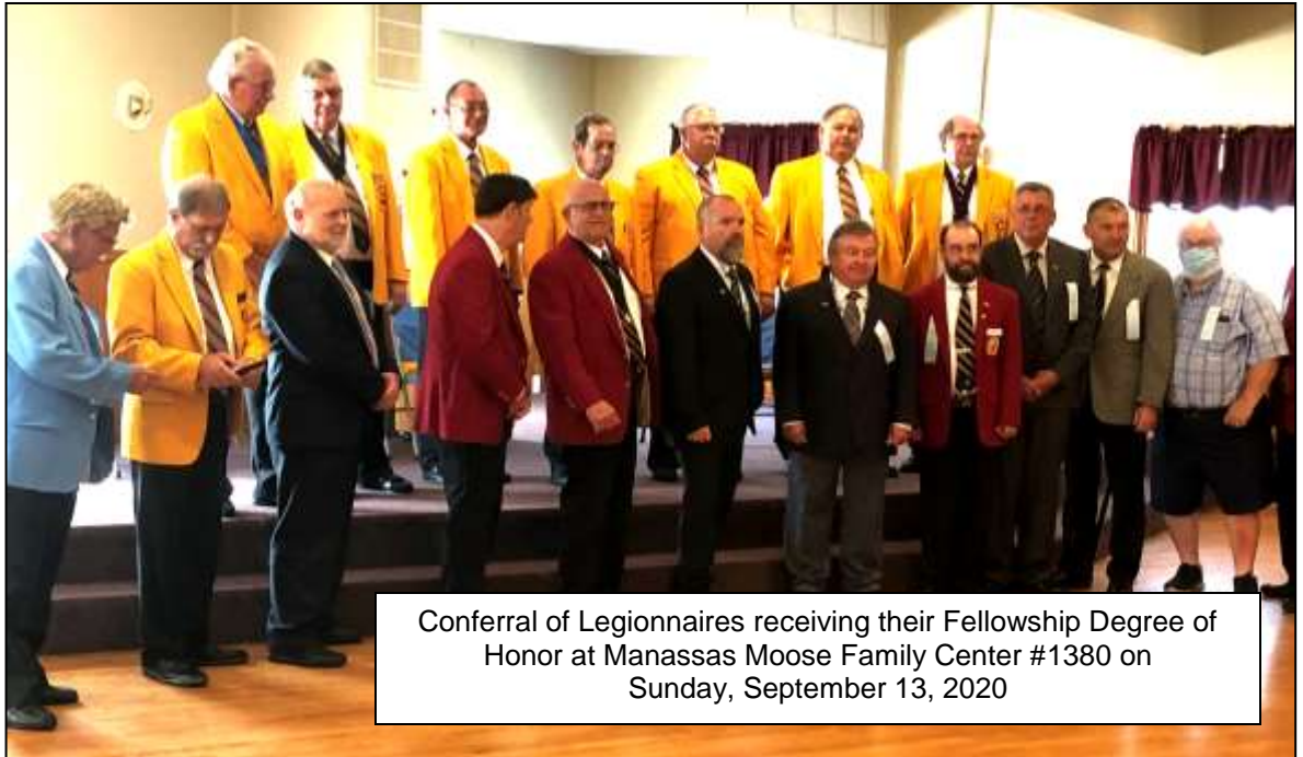
Conferral of Legionnaires receiving their Fellowship Degree of Honor at Manassas Moose Family Center #1380 on Sunday, September 13, 2020