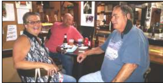
Pictures from the Welcome Back Cookout